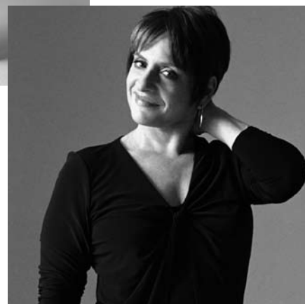
Patti LuPone and Mandy Patinkin.